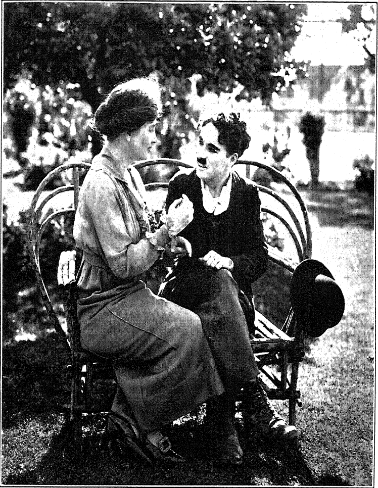
Miss Keller teaching Charlie Chaplin the manual alphabet.